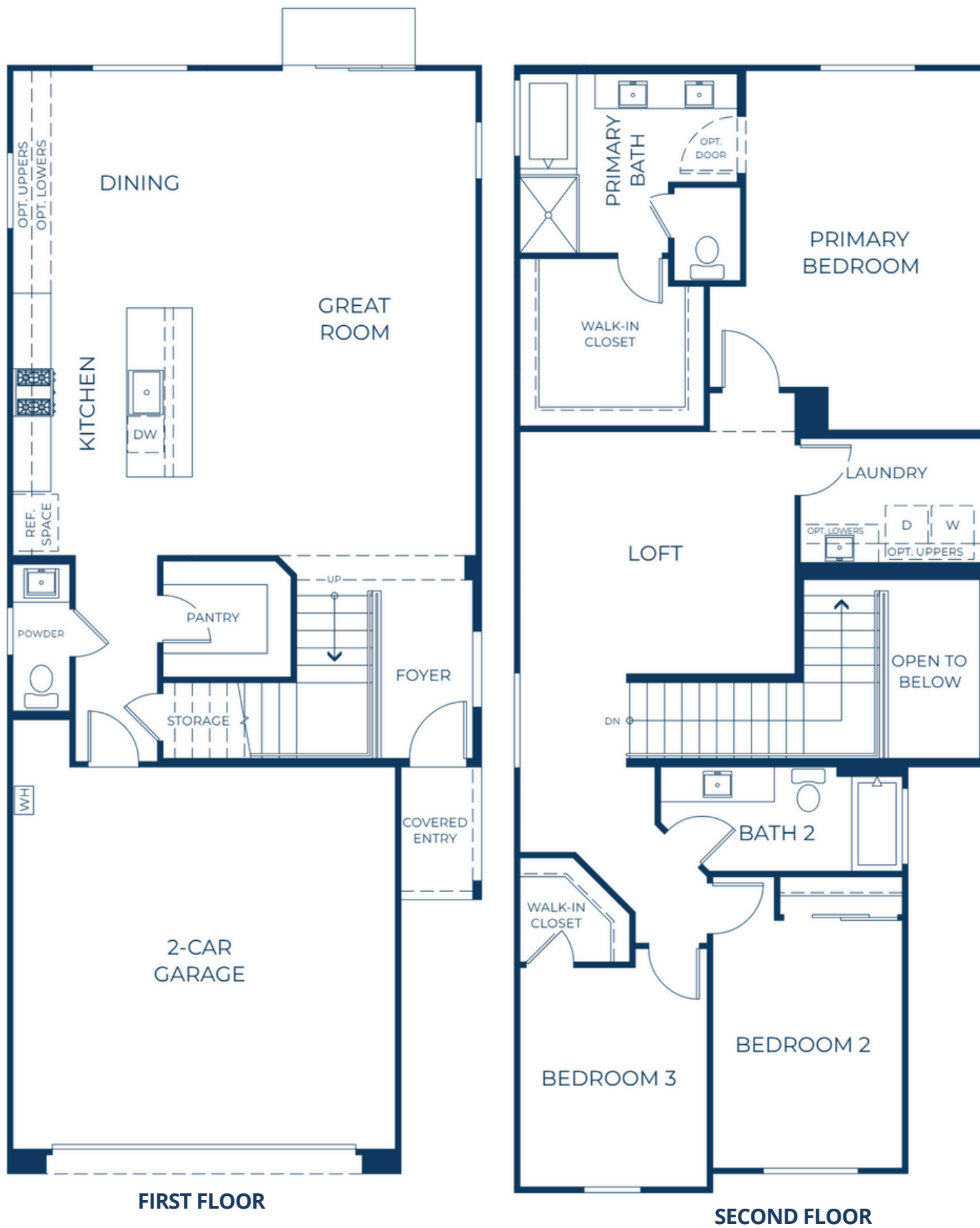
Standard Plan (2170 sq ft) | Two-Story

3 Bedrooms | 2.5 Bathrooms | 2 Car Garage